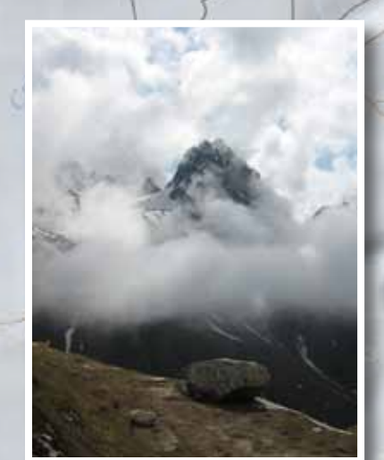
Mint Glacier